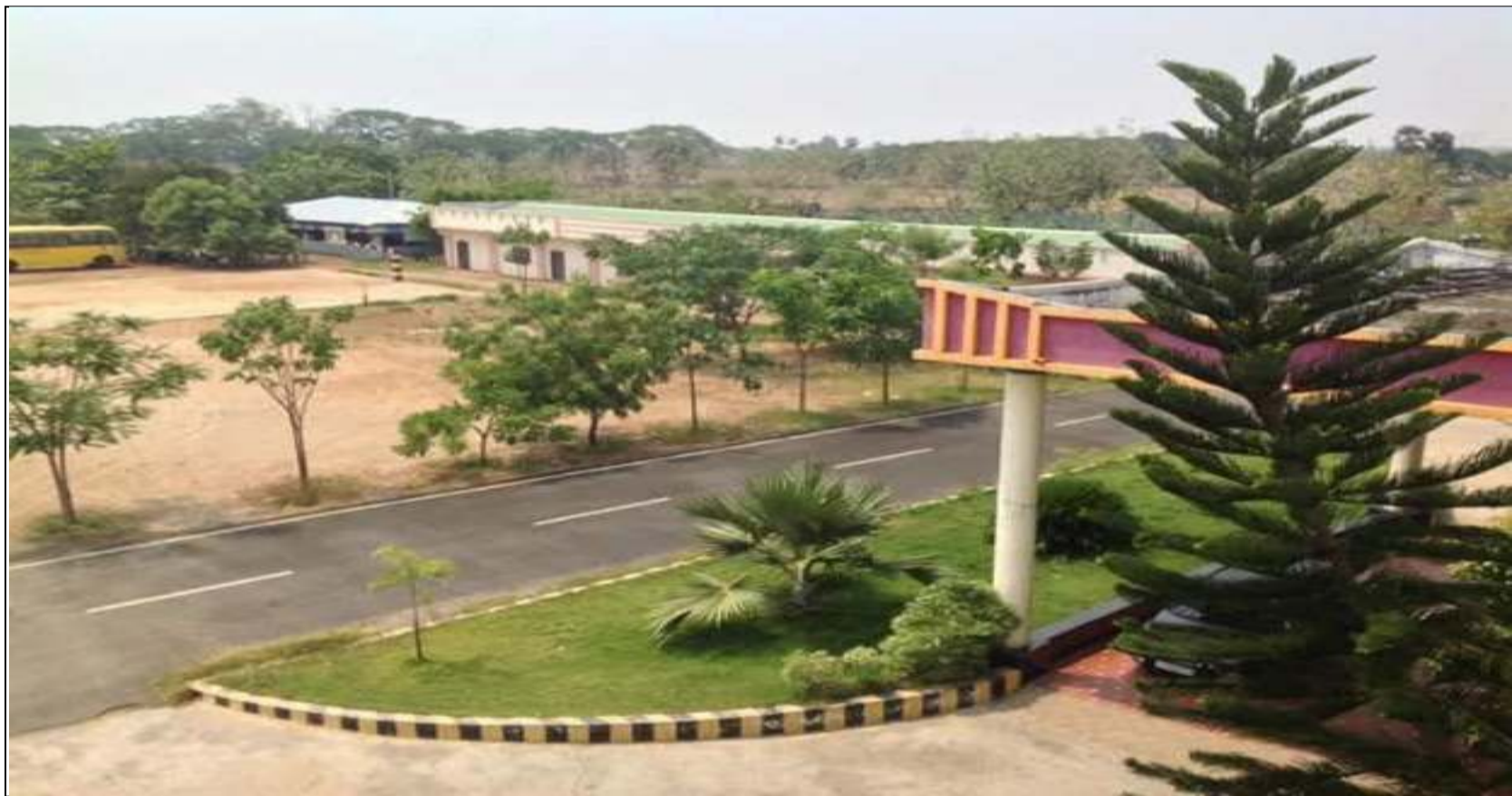
AERIAL VIEW OF GREENERY IN CAMPUS